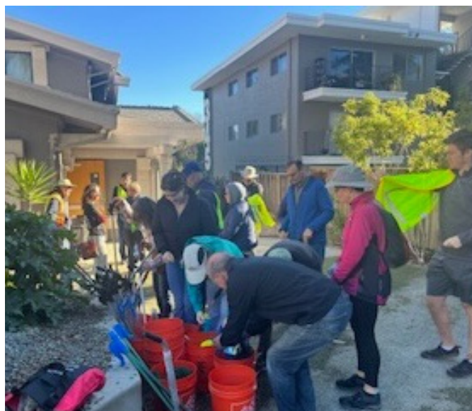
WTBA & Men's Club - MacArthur Blvd Cleanup Day