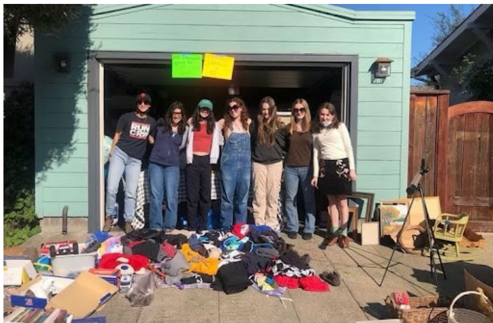
Oakland BBG youth group held a garage sale that drew neighbors from far and near. They raised $350 for Save the Bay. Yasher koach!

PERIODICALS POSTAGE PAID Oakland, CA Permit No. 020299